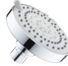
Shower head(ERS-S06 ONLY)