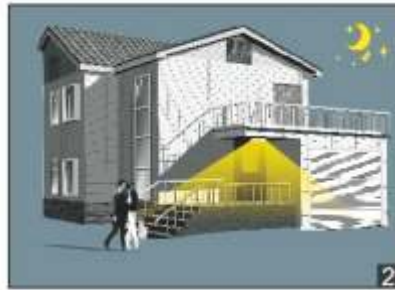
With insufficient daylight, when motion detected, light ON.