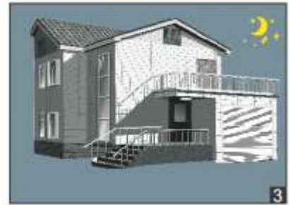
After the last detection and the present hold time elapsed, light OFF.