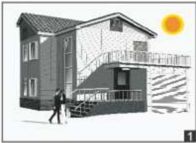
With insufficient daylight, when motion detected, light remains OFF.